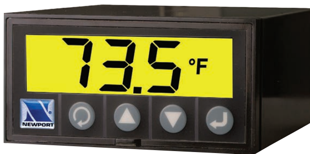
Large digital display mode.

All models shown smaller than actual size.