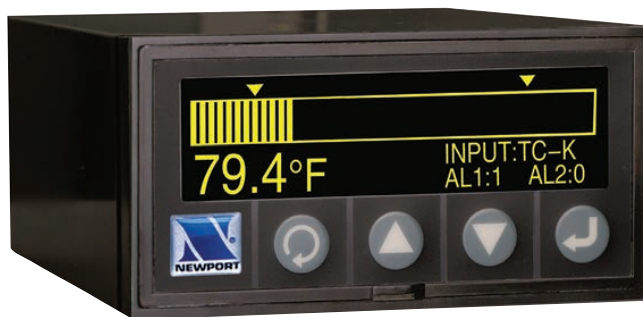
Horizontal bar graph mode.