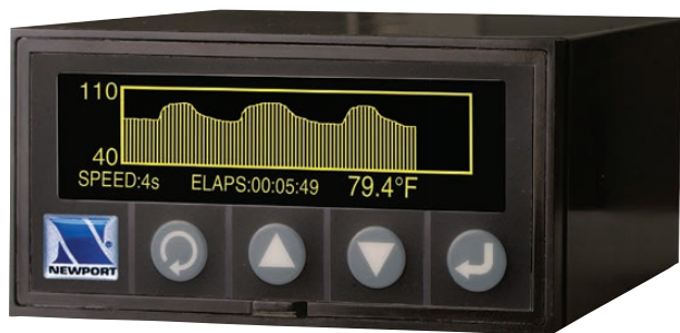
Graphic panel meter shown in line graph charting mode.

With Optional Alarm Relays, Isolated Analog Output, 24 Vdc Excitation Voltage, and Wireless Receiver