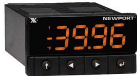
Pt32 Series shown actual size.