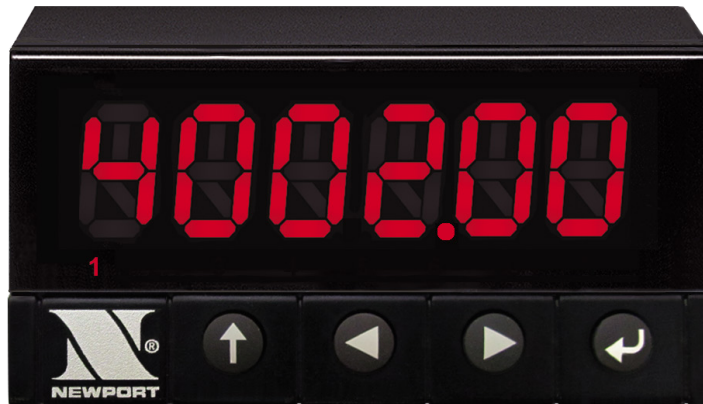
Pt8E Series shown actual size.