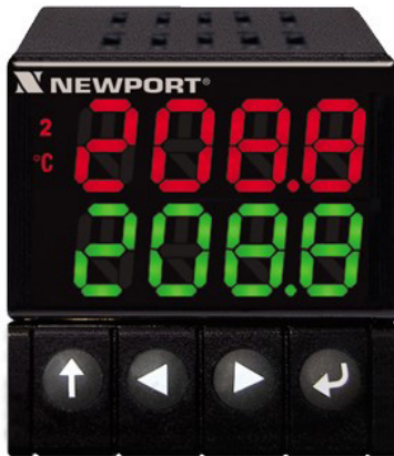
Pt16D Series shown actual size.

Industry Leading Performance...and Easy to Use