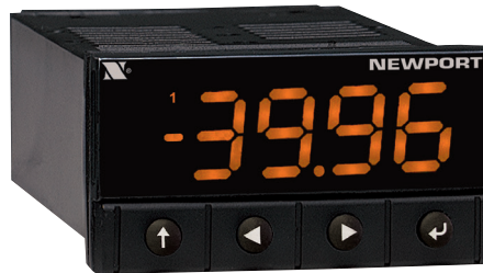
Pt32 Series shown actual size.