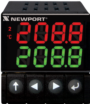
Pt16D Series shown actual size.