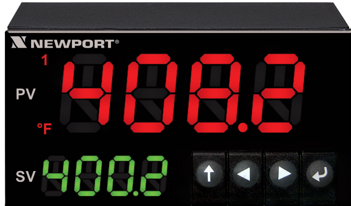
Pt8D Series shown actual size.