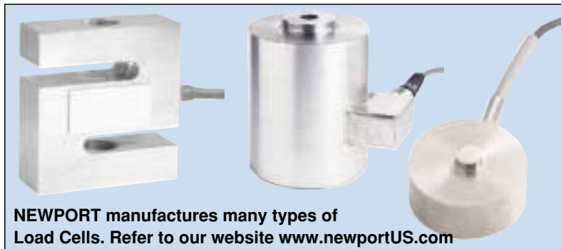
NEWPORT manufactures many types of Load Cells. Refer to our website www.newportUS.com