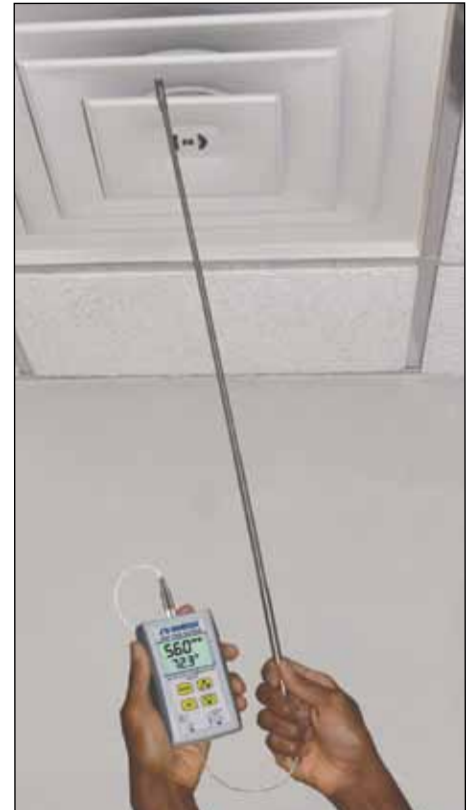
Measuring air flow from an air conditioning duct.

Outdoor/Line of Sight: Up to 120 m (400')