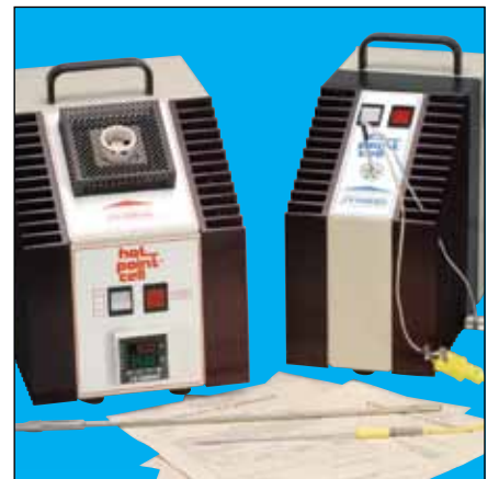
TRCIII ice point™ shown with companion CL950 dry block probe calibrator. See newportUS.com for details.

The TRCIII ice point™ Calibration Reference Chamber relies on the equilibrium of ice and distilled, deionized water at atmospheric pressure to maintain 6 reference wells at precisely 0°C (32°F). The wells extend into a sealed cylindrical chamber containing the distilled, deionized water. The outer walls of the chambers are cooled by thermo-electric cooling elements. The increase in volume produced by the creation of ice crystals within the