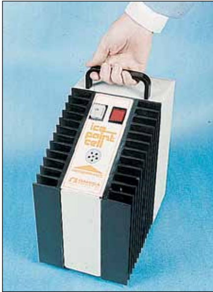
Sturdy handle for easy portability.