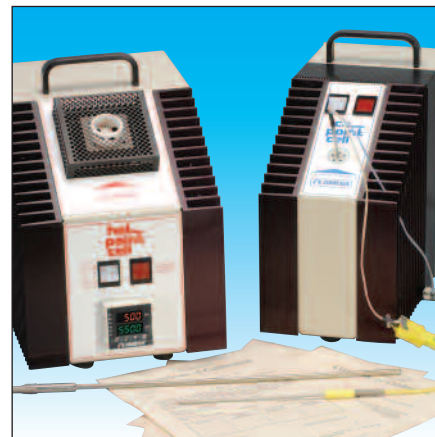
TRCIII ice point™ shown with companion CL950 dry block probe calibrator, $3395. See page K-23 for details.

occurs. TRP reference probes, used with the TRCIII, provide a junction from thermocouple alloys to copper wire, at the probe tip. When inserted into the TRCIII, TRP probes enable the change from thermocouple alloy to copper at 0°C (32°F), for accurate cold junction compensation.