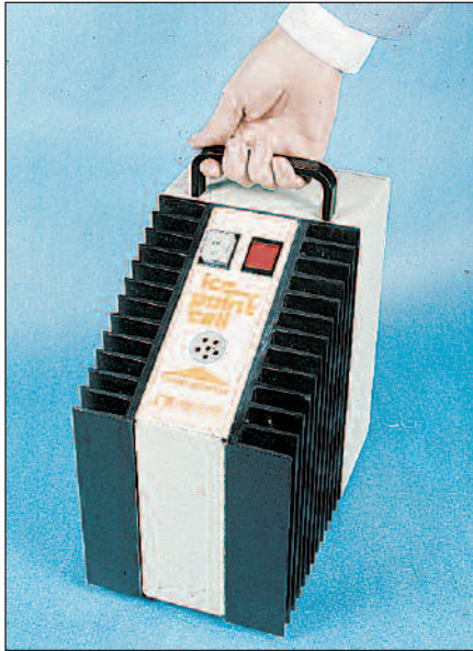
Sturdy handle for easy portability.